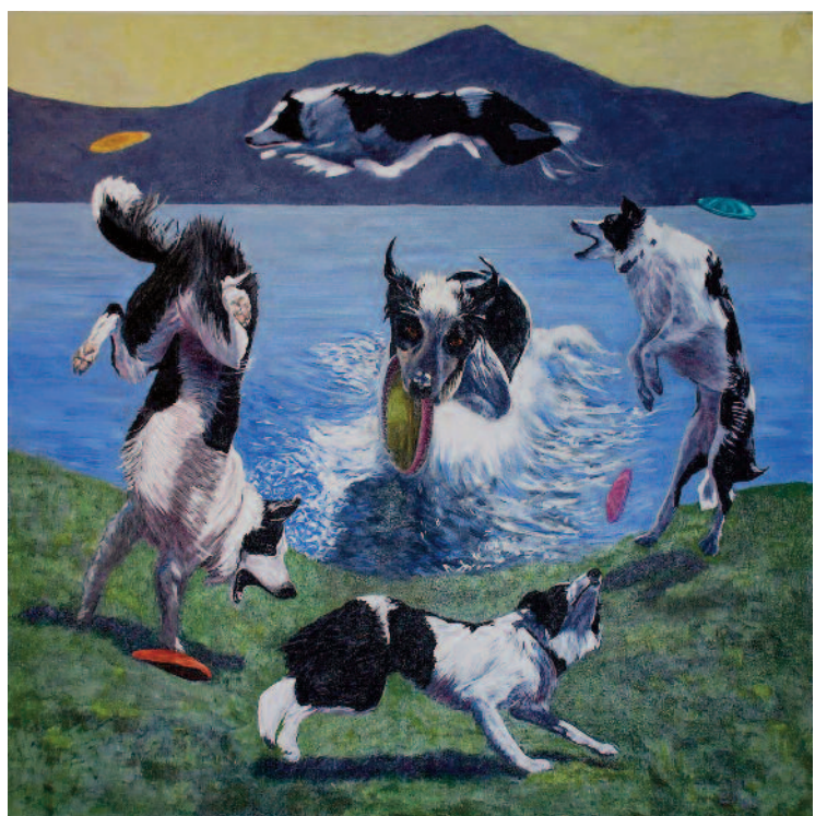
"Ring of Tam" by Ellen Reintjes